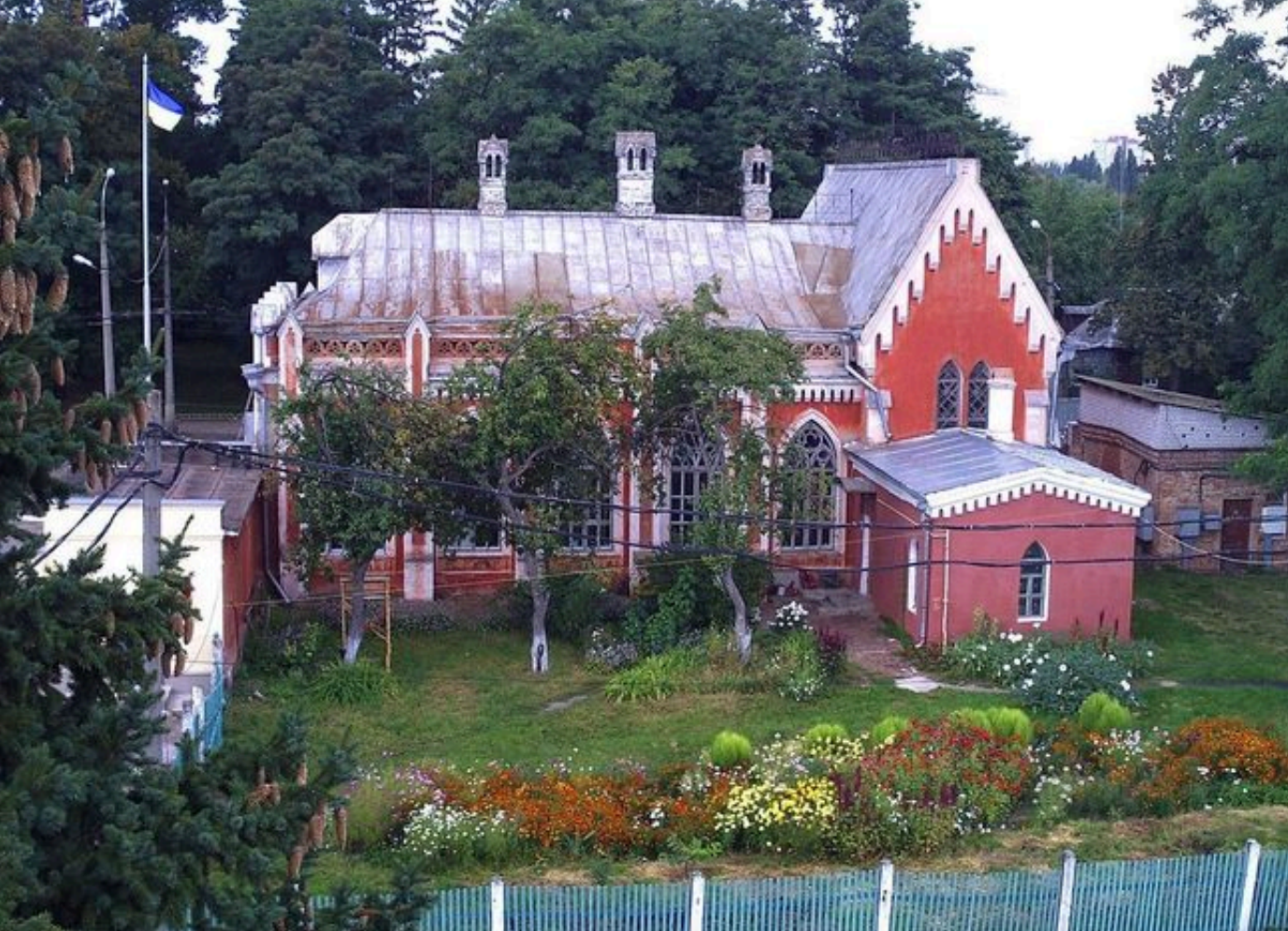
Chernihiv. Vasyl Tarnovsky Museum of Ukrainian Antiquities (founded in 1902)