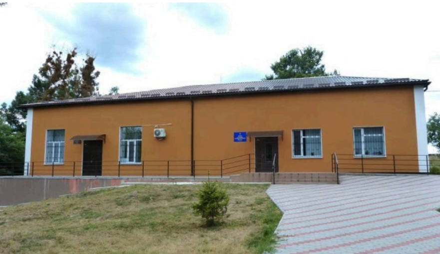
Ivankiv, Kyiv region. Local history museum