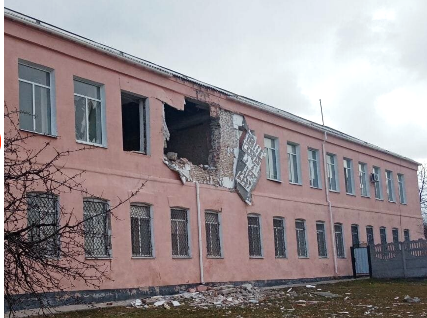
Vasylivka, Zaporizhia region. Historical and Architectural Museum "Popov Manor"