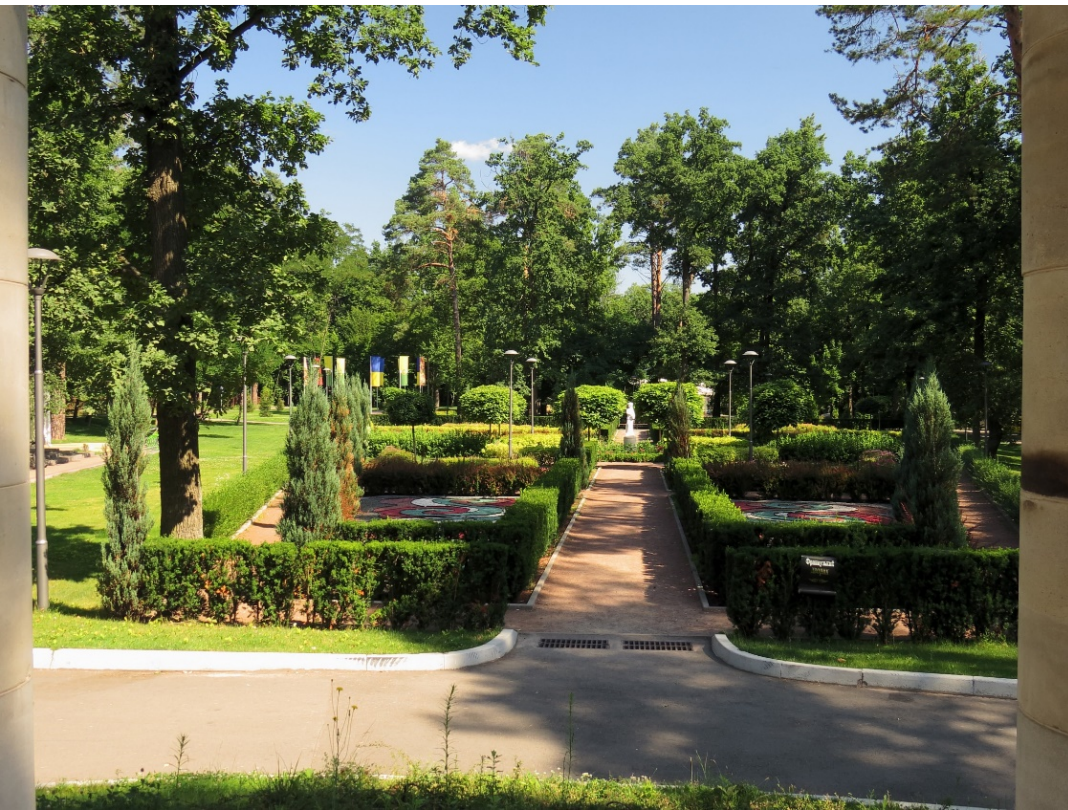
Bucha, Kyiv suburbs

For now, we are informed about raped, tortured, and murdered Ukrainian civilians (adults and children) and in the suburbs of Kyiv we are talking about. This is just what we know as of now.