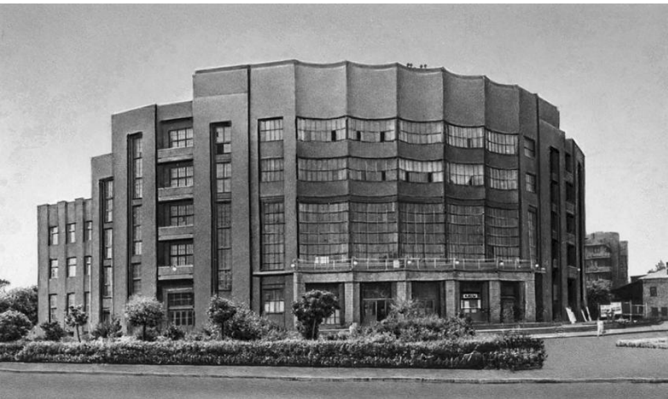
Monument of constructivism